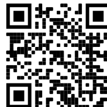
St. Mark's Website

If you'd like to receive emails from St. Mark's or your contact information needs to be updated, please scan the QRC below. Or, fill out this form and drop it in the offering plate.