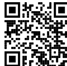
St. Mark's Website

If you'd like to receive emails from St. Mark's or your contact information needs to be updated, please scan the QRC below. Or, fill out this form and drop it in the offering plate.