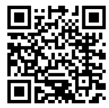
St. Mark’s Website