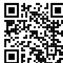
St. Mark's Website